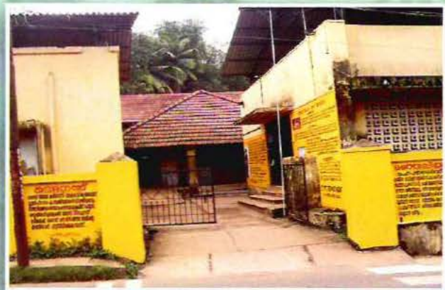
Front View of Community Health Centre, Palloor