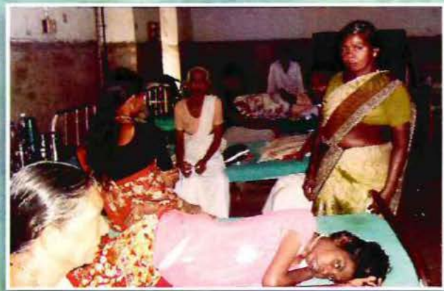
Inside the Community Health Centre, Palloor