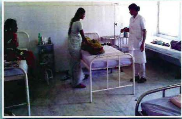
Community Health Centre, Thirunallar