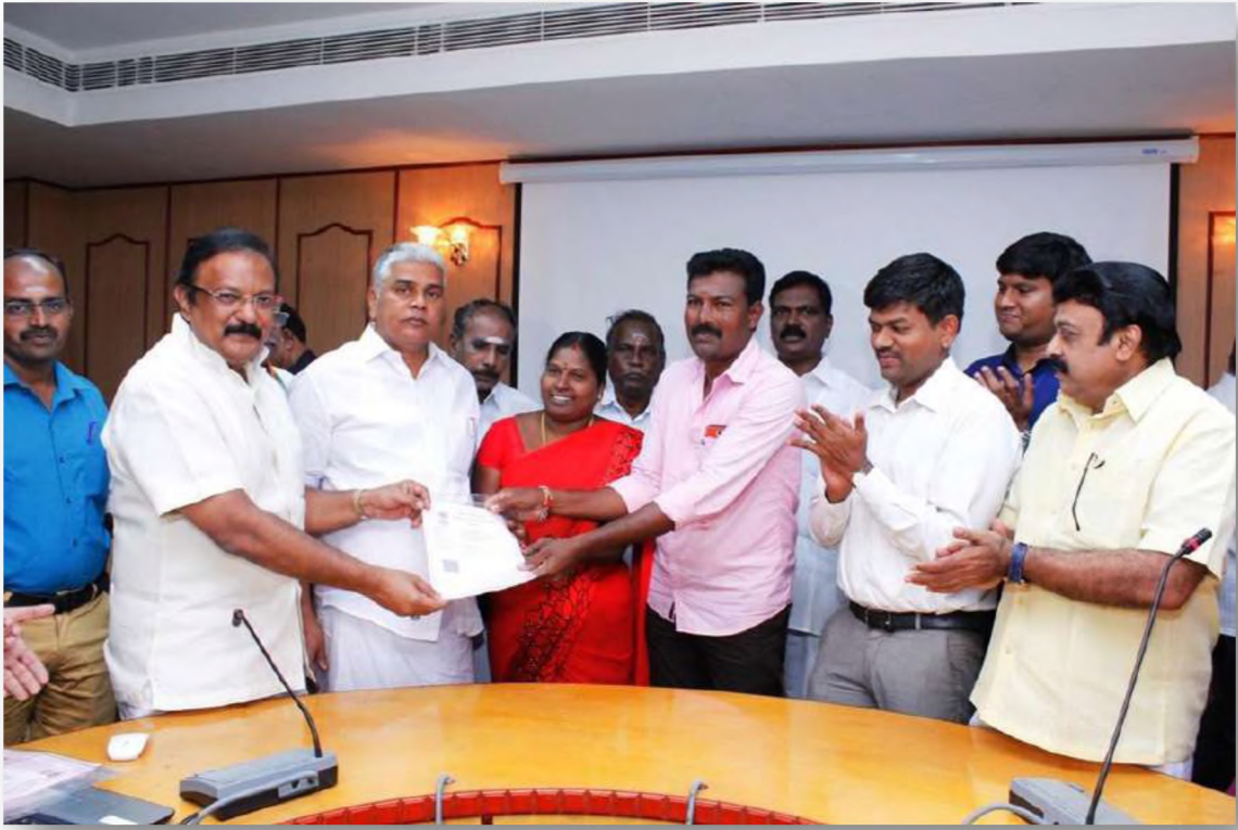
Hon'ble Minister for Welfare, Puducherry has distributed education assistance to the tune of Rs.31.50 lakhs to 61 nos. of beneficiaries the members of "Puducherry Building and Construction Workers Welfare Board" in Karaikal District.