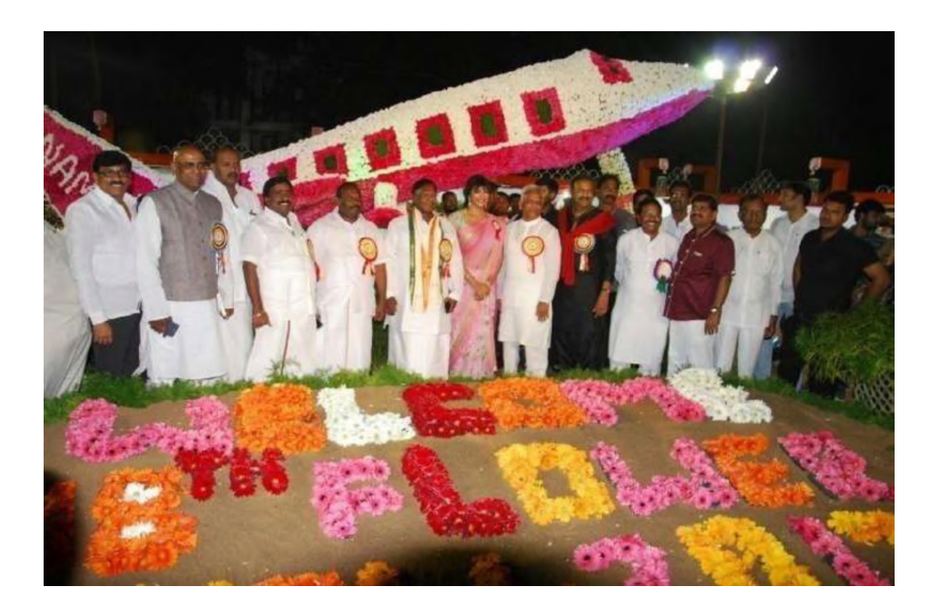
18<sup>th</sup> Flower show was conducted on 6<sup>th</sup> to 8<sup>th</sup> January, 2017 at GMC Balayogi Sports Complex, Yanam. The programme was inaugurated by the Hon'ble Chief Minister Thiru. V.Narayanasamy and the valedictory programme was attended by the Hon`ble Lt. Governor, Puducherry.

Coconut seedlings were distributed to 450 numbers of SC farmers and public of Yanam@ 2 seedlings per each person on 19-11-2016 at Darialathippa village and on 21-11-2016 at Yanam Market Committee complex, Yanam. The distribution programme was started by the Hon`ble Minister for Health, Shri. Malladi Krishna Rao. Regional Administrator of Yanam had also attended the function.