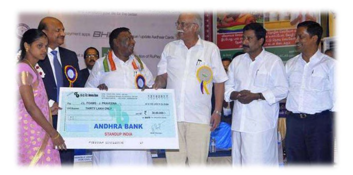
Union Minister for Civil Aviation Pusapati Ashok Gajapathi Raju handing over a Loan cheque to a beneficiary at the inauguration of the Pradan Mantri Mudra campaign

The Government of India with a view to promote Mudra Loans, financial inclusion schemes and digital payment methods to encourage consumers and merchants to increasingly shit to these payment modes. Accordingly Mudra Promotion Campaign conducted on 12.10.2017 at Kamban Kalai Arangam, Puducherry. Various stalls were put up at the venue for Banks, Insurance Companies and Govt. Departments . Hon'ble Union Minister of Civil Aviation was Srhi Pusapati Ashok Gajapathy Raju was the Chief Guest for the Function.