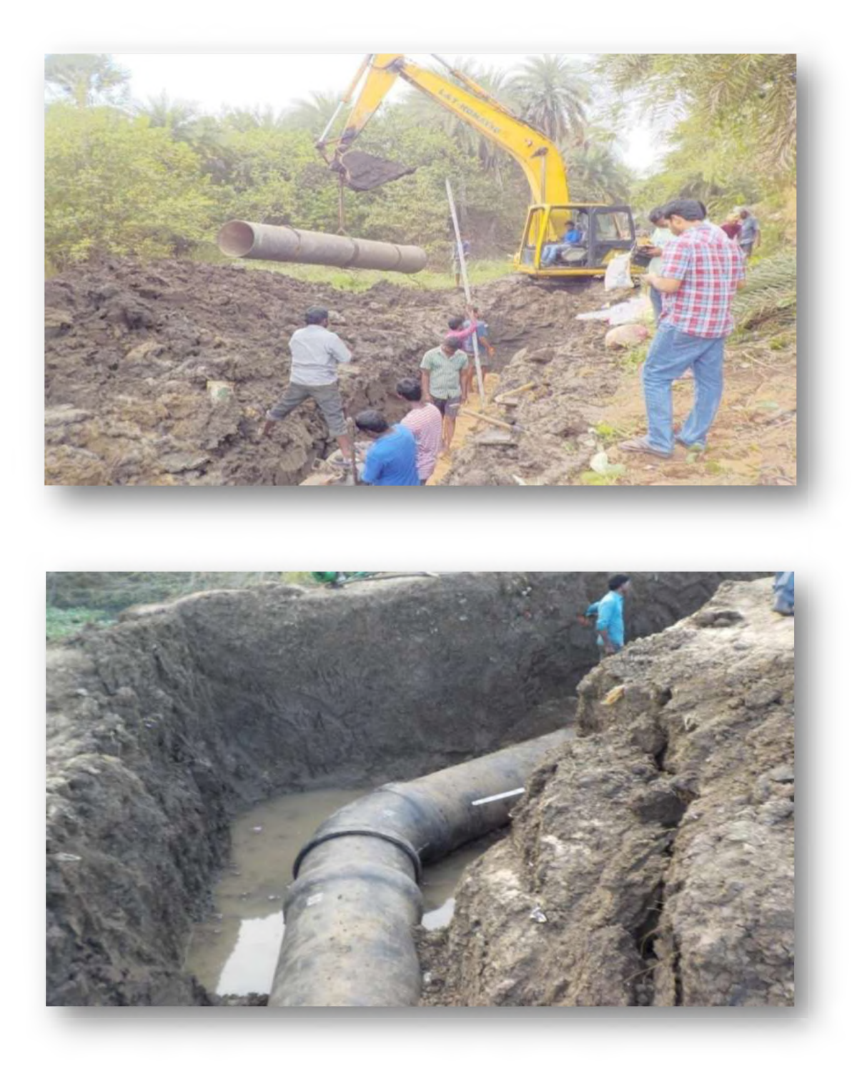
By completing this project two crops of Rabi and Kharif will be cultivated by the farmers. The discharge capacity of motor pump set is proposed 17.50 cusecs.

Interlinking of French channel and Adaviplam Channel with pumping at Yanam – is to supply the irrigation water from French Channel through the DI pipes to the society lands of Kanakalapeta SC field labours society 28 acres, Bheem Nagar SC field labours society 15 acres, Farampeta SC field labour society 129 acres and Dariyalthippa SC field labour society 191 acres.